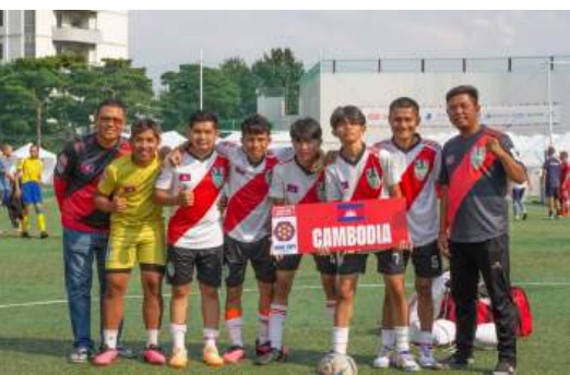
HFCA SR Sras Srong Community Village Program

Our three football programs in the Siem Reap province is still going strong, with high attendance of both boys and girls on the football pitch!