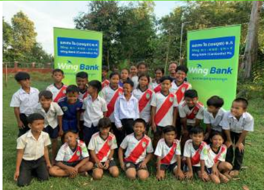
HFCA SR Oroong Community Village Program